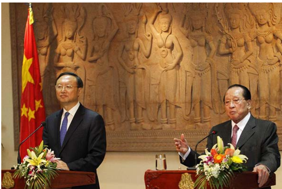
Cambodian Deputy Prime Minister and Foreign Minister Hor Namhong (R) and visiting Chinese State Councilor Yang Jiechi attend a joint news conference in Phnom Penh, capital of Cambodia, on Dec 30, 2014.