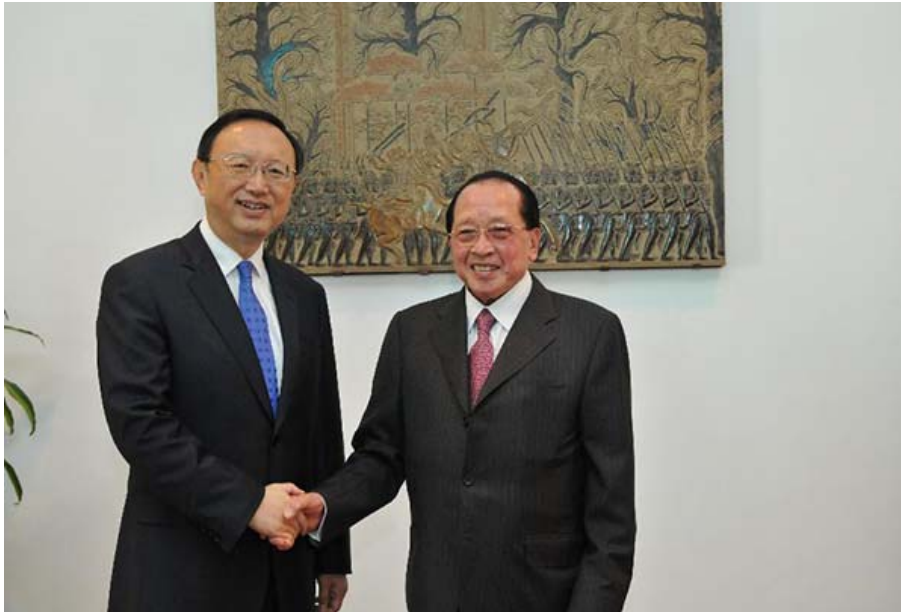
Cambodian Deputy Prime Minister and Foreign Minister Hor Namhong (R) shakes hands with visiting Chinese State Councilor Yang Jiechi in Phnom Penh, Cambodia, Dec 30, 2014.